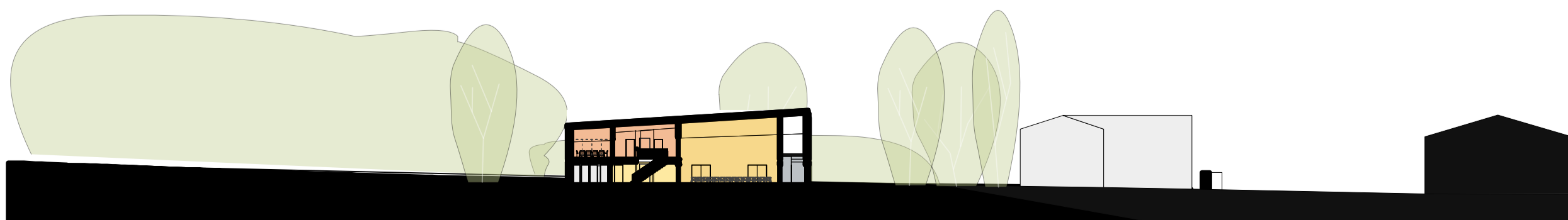
Long site section 1:200